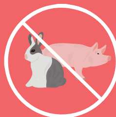
Pork & Rabbit