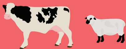
Beef & Lamb