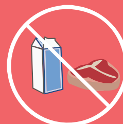
Meat & Dairy Together