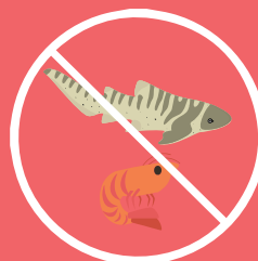
Catfish, Sturgeon & Shellfish